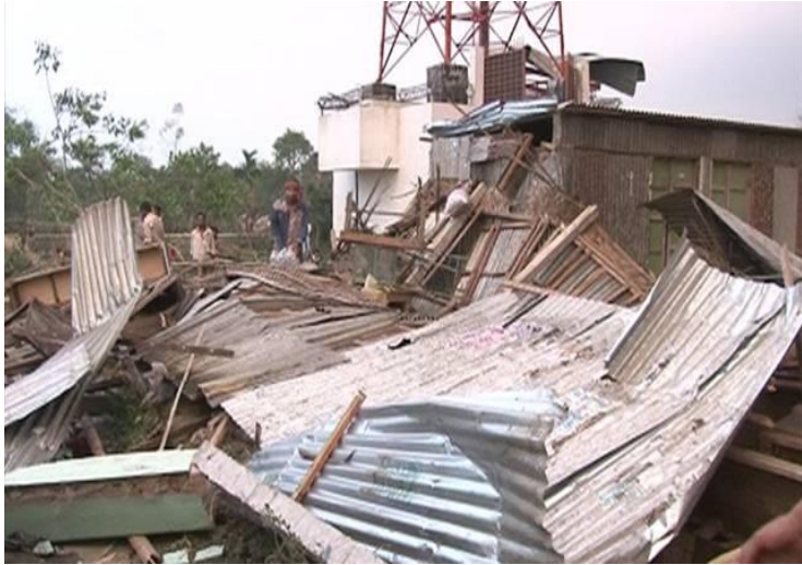
Fig. 1 Tornado affected Brahmanbaria Fig. 2 Damaged structures and houses