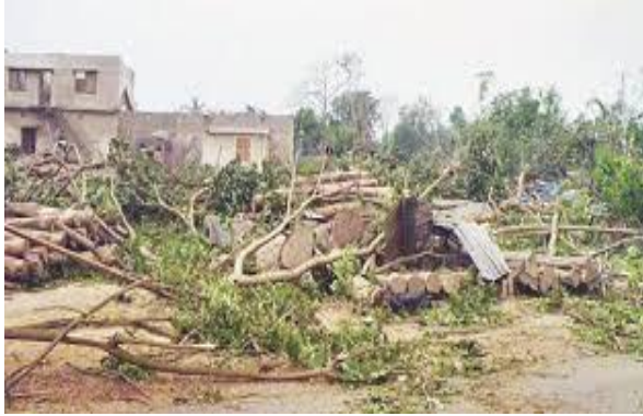
Fig. 4 Uprooted Trees