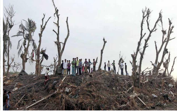
Fig.5 Broken tree due to devastating the storm