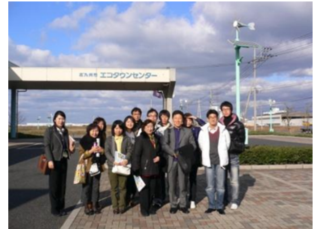
Exchange with Tongyeong