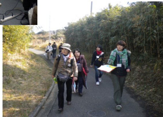
Green mapping in Ainoshima