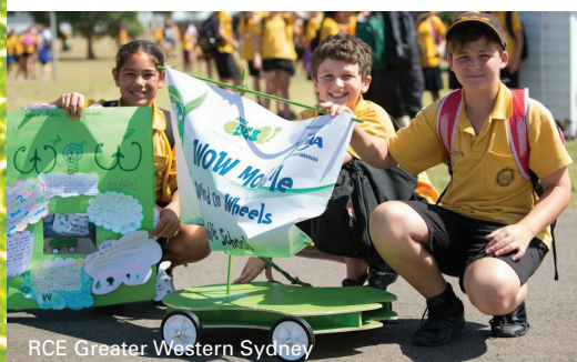
RCE Greater Western Sydney