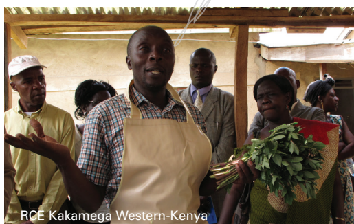
RCE Kakamega Western-Kenya