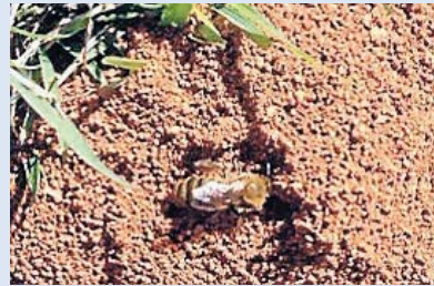
A Richmond ground-nesting bee.