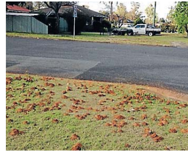
Not ant hills, bee hills: The bee mounds in the nature strip in Richmond.

"Given the size, the hairiness and density of the nesting aggregations,