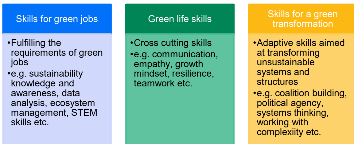
Figure 1 Green skills framework (adapted from Brookings, 2022)

We are also working within the context of a rapidly changing tertiary education landscape due to the advent of numerous new reform policies. Elements being prioritised include: